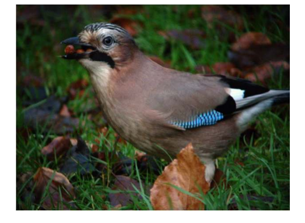
Photo: A jay taking advantage of peanuts provided at a nearby bird feeder.

Woodland is a valuable feeding and breeding habitat for a wide variety of bird species. Each of the woodland nature reserves featured in this pack has a wide diversity of bird species. Many of the nearby houses provide food to the birds on bird-tables and hanging bird feeders. Woodland birds often fly to nearby gardens to make use of these bird feeders.