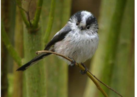
A long-tailed tit

Keep an eye out for other signs of birds, such as moulted feathers, or the shells of newly hatched eggs (the parents remove the empty shells from the nest, and drop them nearby).