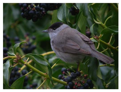
....and a blackcap warbler

Some of the birds that breed in Bridgend's woodlands live here all year (e.g. the long-tailed tit), but others (e.g. the blackcap warbler) are migratory and spend the winter in warmer parts of the world, such as Spain, or even Africa. We usually think of these migratory birds as Welsh birds visiting Africa for the winter, but you could also say that these are African birds visiting Wales to breed!